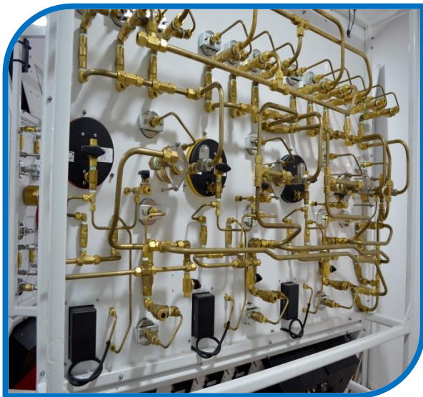
Mixed Gas Control Panel Back – Tubing System

An IMCA D037 compliant Three Diver Surface Mounted Control Mixed Gas Panel is designed to individually control and monitor the primary and secondary air supply of each diver. It has an individual gauges and regulator assigned for each diver.