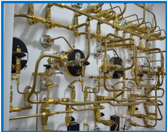
THREE DIVER MIXED GAS CONTROL PANEL - BACK