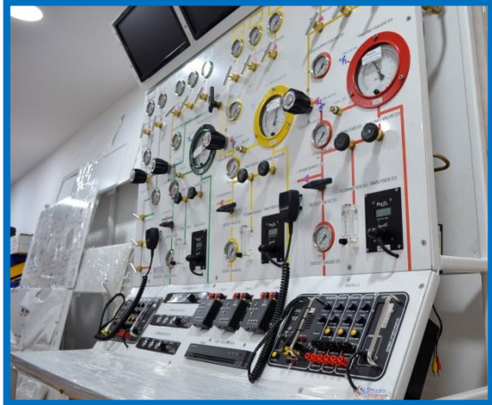
THREE DIVER MIXED GAS CONTROL PANEL - FRONT